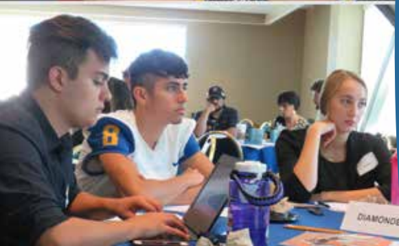
Top to Bottom: Student participants from Prescott, Phoenix and Tucson gathered at Future leaders Town Halls to discuss the challenges facing Arizona's criminal justice system.

Arizona needs to stop condemning people to a lifetime of collateral consequences that extend beyond completion of sentence.