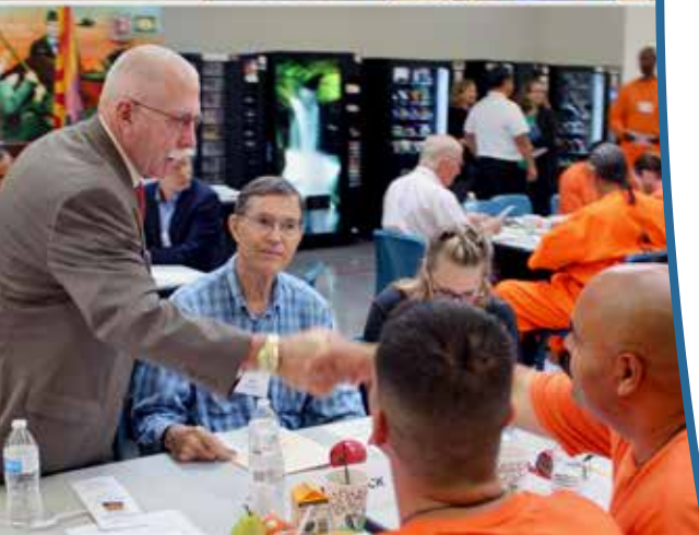
Top: Participants at the Sierra Vista Community Town Hall.