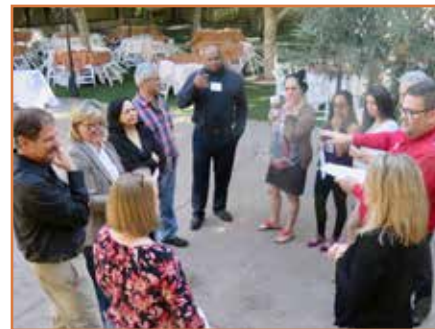
Participants gather to discuss an amendment to the recommendations report during the Plenary Session.

- from the 111th Arizona Town Hall Report of Recommendations