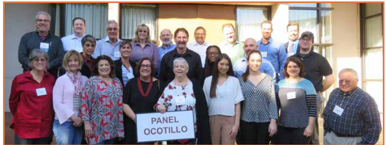
Participants of Panel Ocotillo at the 111th statewide Town Hall

Completed Town Hall reports are published and made available to Arizona Town Hall members, elected officials (including the Arizona Legislature), public libraries and the general public. Download digital copies for free online at www.aztownhall.org or call (602) 252-9600 to request a printed copy.