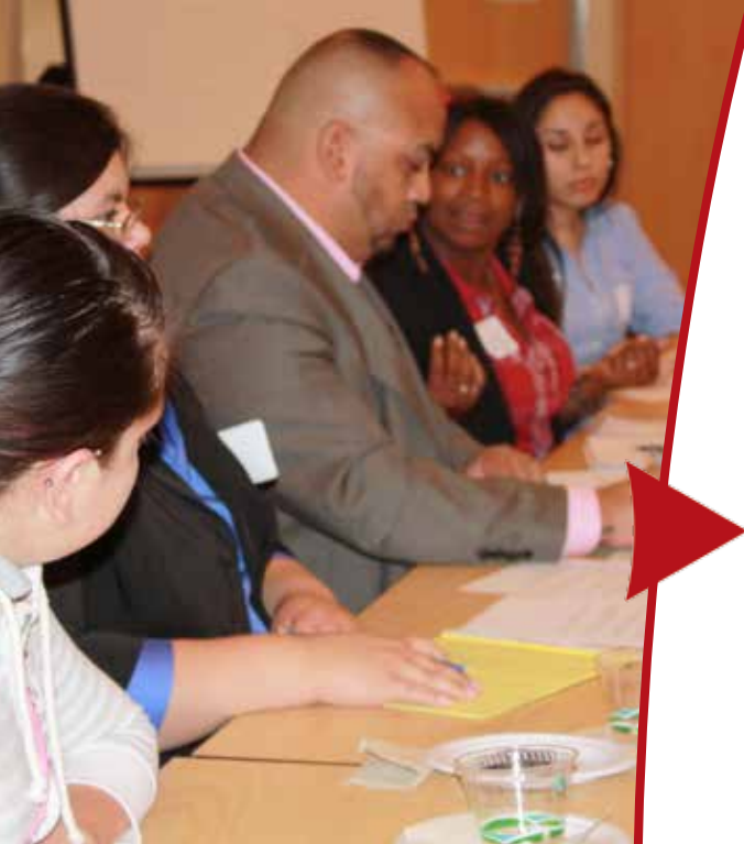
Participants of the Youth Town Hall discuss Higher Education.