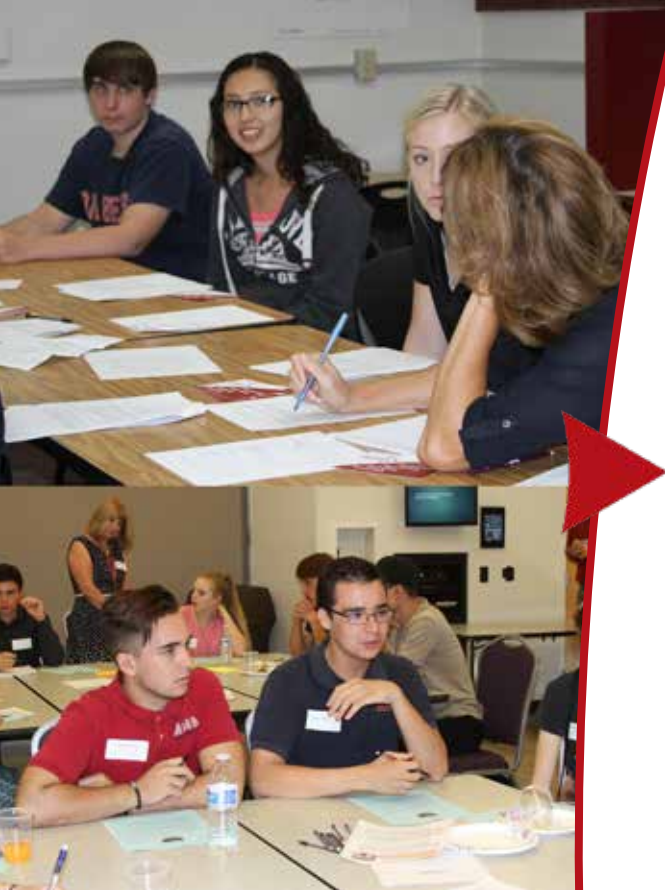
Student participants discuss the challenges facing Arizona's education funding policies in Payson and the Verde Valley.