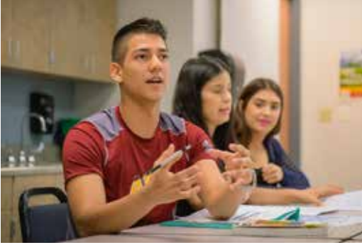
107th Future Leaders Town Hall, San Luis

Hundreds of high school and college students from around Arizona experienced civic participation first hand using Arizona Town Hall's model of civil discourse at Future Leaders Town Halls on the topics of Transportation and Arizona and Keeping Arizona's Glass Full . These events consistently receive rave reviews and have engaged the next generation of leaders in the Town Hall process.