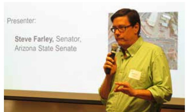
106th Community Outreach Program, Tucson

Individuals who participated in the Town Hall discussions serve as presenters for the programs and share their thoughts on the recommendations. Audience members receive the printed highlights piece and are invited to engage in a Town Hall style discussion that sets priorities and action steps for their communities.