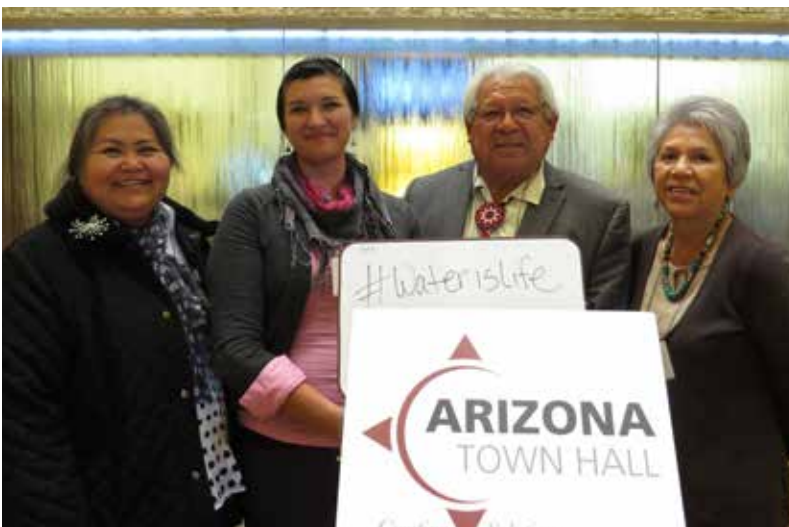
108th Town Hall, Keeping Arizona's Water Glass Full, Mesa

Each year Arizona Town Hall addresses important issues that affect Arizona. In the spring, Arizona Town Hall met in Tucson to address Transportation and Arizona . In the fall, Arizona Town Hall met in Mesa to address Keeping Arizona's Water Glass Full .