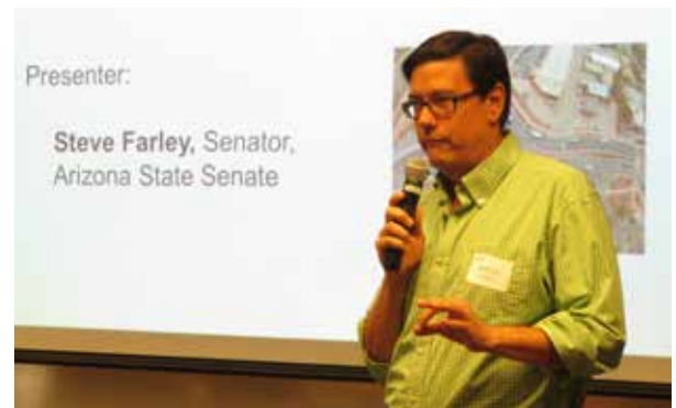
106th Community Outreach Program, Tucson

Individuals who participated in the Town Hall discussions serve as presenters for the programs and share their thoughts on the recommendations. Audience members receive the printed highlights piece and are invited to engage in a Town Hall style discussion that sets priorities and action steps for their communities.