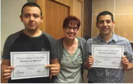
108th Future Leaders Town Hall, South Mountain Community College

Hundreds of high school and college students from around Arizona experienced civic participation at Future Leaders Town Halls on the topics of Arizona & Mexico and Financing Arizona's Future . These events develop civic leadership skills for Arizona's next generation of leaders.