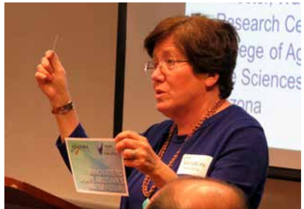
107th Community Outreach Program, Tucson

After the statewide Town Hall, recommendations are communicated to a broader audience through traditional and social media, published reports, and Community Outreach Programs held around the state.