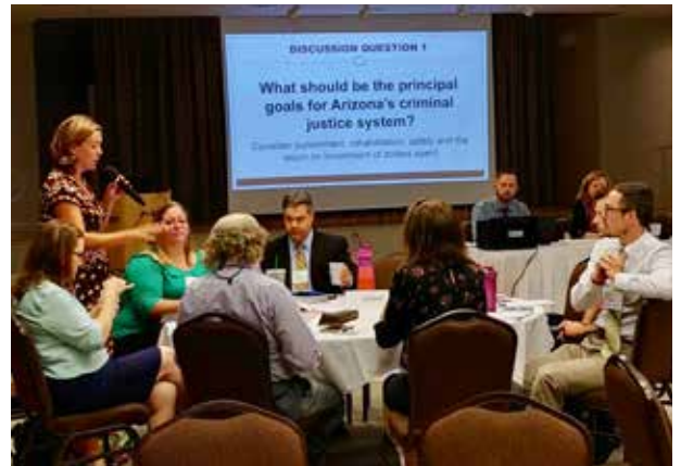
"Criminal Justice in Arizona" Community Town Hall, Marana

After the statewide Town Hall, recommendations are communicated to a broader audience through traditional and social media, published reports and Community Outreach Programs held around the state.