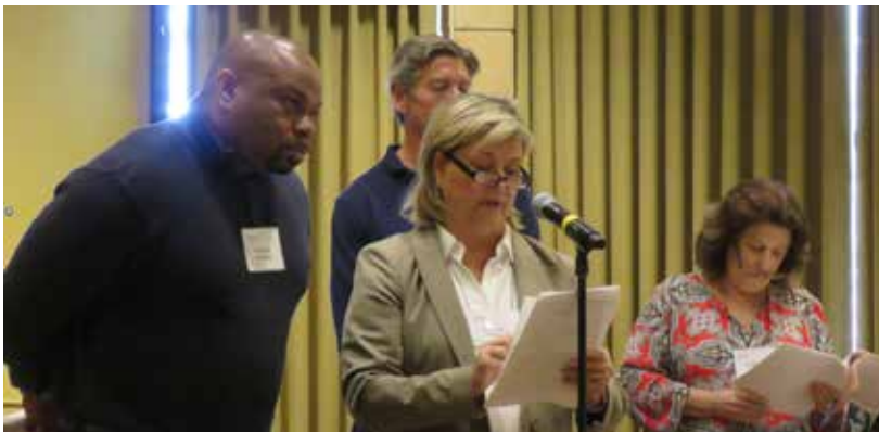
111th statewide Town Hall, “Criminal Justice in Arizona,” Phoenix

Town Hall gatherings are designed to empower participants to be constructive members of their communities and to engage with others to address community issues. The impact of gatherings is magnified by extensive media coverage and through the distribution of reports.