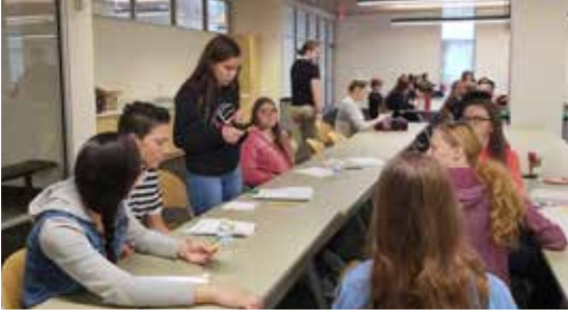
"Criminal Justice in Arizona" Future Leaders Town Hall, Yavapai College, Prescott Campus

Future Leaders Town Halls foster development of civic leadership skills for Arizona's next generation of leaders and allow them to have a voice on important policy issues.