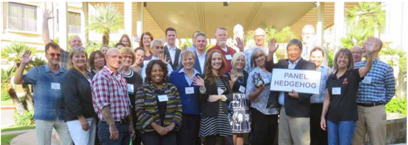
Participants of Panel Hedgehog, 111th statewide Town Hall, “Criminal Justice in Arizona”