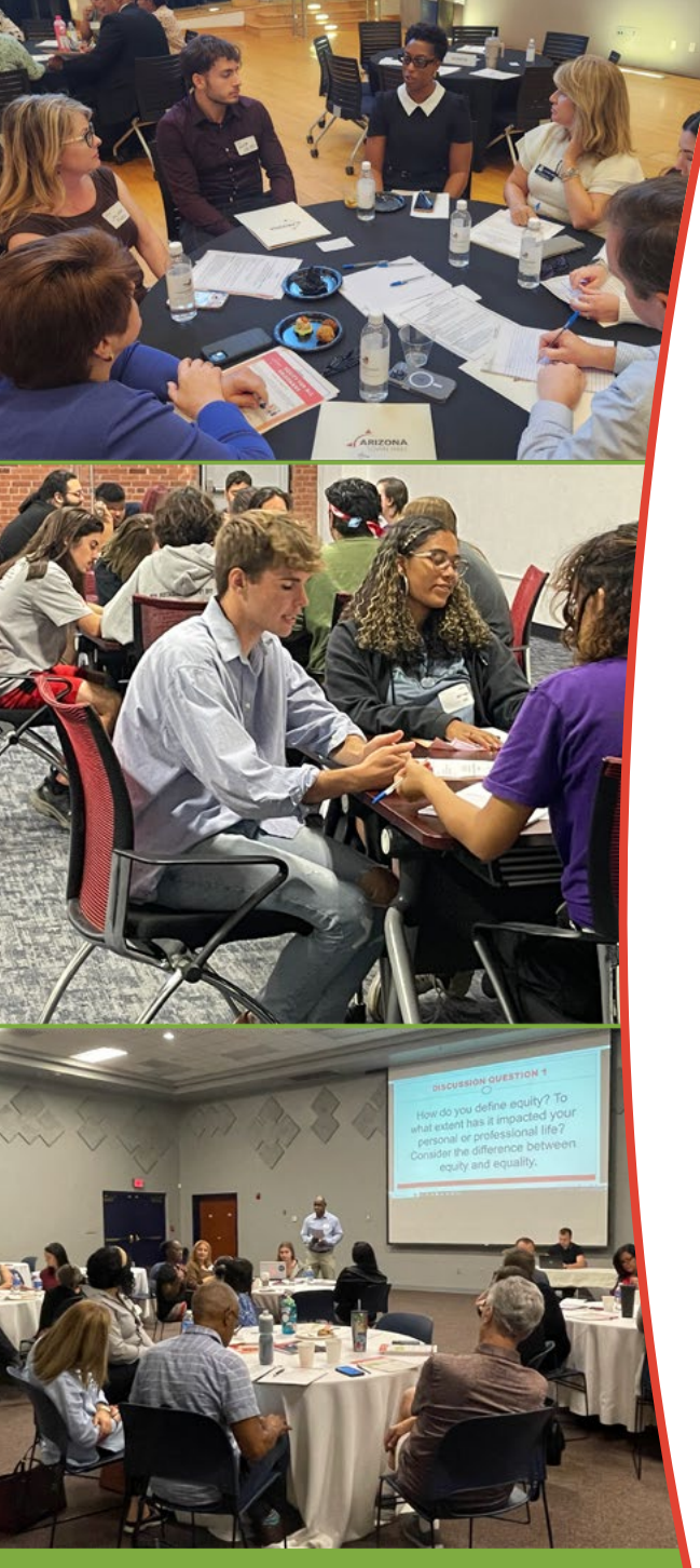
Top to bottom and right: Participants engage in discussions at town halls at Phoenix and Tucson.