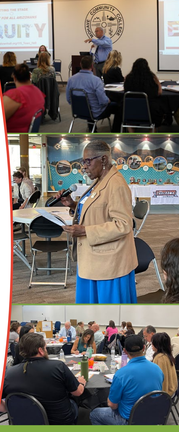
Top to bottom: Participants at the Bullhead City, Flagstaff, and Lake Havasu City community town halls.

• <u>Transportation</u> is especially critical in rural areas to enable access to essential services such as food, medical care, education, social services, etc. This includes safe and drivable roads and bike paths, flights, buses, sidewalks, and crosswalks. Roads are used by those who live in urban areas and who like to recreate or travel through rural areas. Funding formulas do not factor in or adequately value the unique circumstances of rural Arizona.