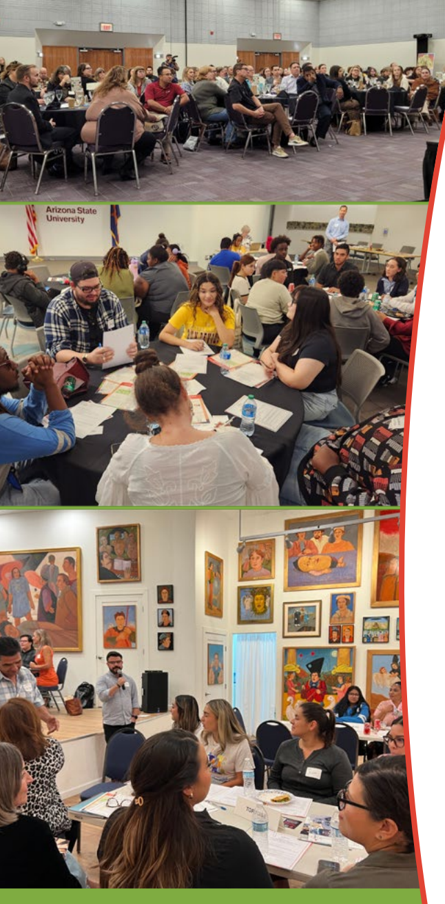
Top to bottom: Participants listen to presenters and engage in discussions at town halls in Tempe, Phoenix, and Nogales.

"Equity is a verb; it requires action. If we invest in our people and communities now, then we won't have to invest in remedial measures later."