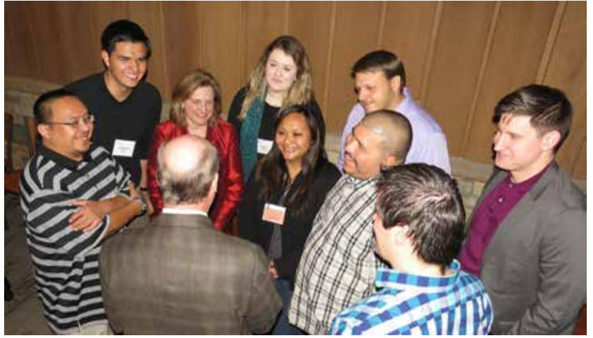
105th Town Hall, Arizona's Economy, Grand Canyon

Each year Arizona Town Hall addresses important issues that affect Arizona. In the spring, Arizona Town Hall met in Tucson to address Vulnerable Populations . In the fall, Arizona Town Hall met at the Grand Canyon to address Arizona's Economy . Both Town Halls were well attended. The Spring Town Hall was particularly noteworthy because of its focus on vulnerability, a condition that affects diverse groups of people who are vulnerable to loss or injury for different reasons.