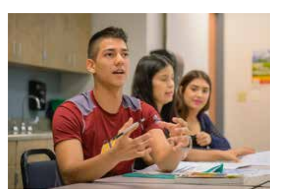
107th Future Leaders Town Hall, San Luis

Hundreds of high school and college students from around Arizona experienced civic participation first hand using Arizona Town Hall's model of civil discourse at Future Leaders Town Halls on the topics of Transportation and Arizona and Keeping Arizona's Glass Full . These events consistently receive rave reviews and have engaged the next generation of leaders in the Town Hall process.