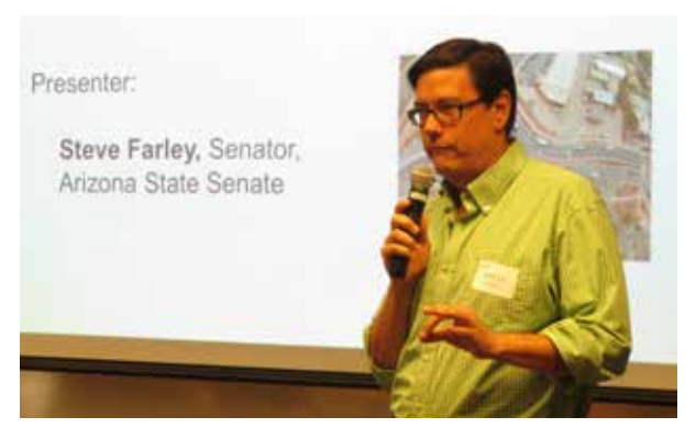
106th Community Outreach Program, Tucson

Individuals who participated in the Town Hall discussions serve as presenters for the programs and share their thoughts on the recommendations. Audience members receive the printed highlights piece and are invited to engage in a Town Hall style discussion that sets priorities and action steps for their communities.