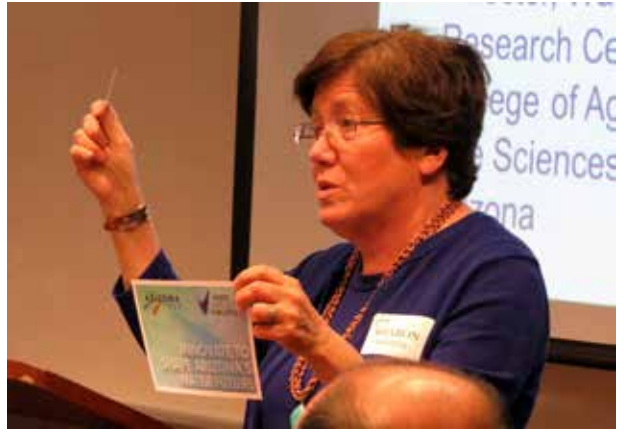
107th Community Outreach Program, Tucson

After the statewide Town Hall, recommendations are communicated to a broader audience through traditional and social media, published reports, and Community Outreach Programs held around the state.