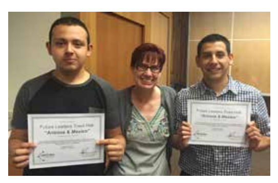
108th Future Leaders Town Hall, South Mountain Community College

Hundreds of high school and college students from around Arizona experienced civic participation at Future Leaders Town Halls on the topics of Arizona & Mexico and Financing Arizona's Future. These events develop civic leadership skills for Arizona's next generation of leaders.