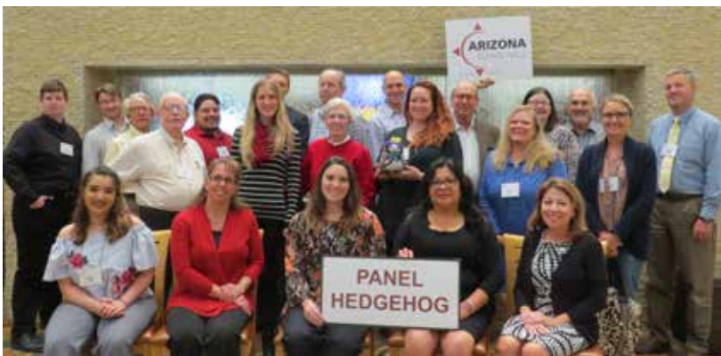
110th statewide Town Hall, “Funding preK-12 Education,” Mesa

Town Hall gatherings are designed to empower participants to be constructive members of their communities and to engage with others to address community issues. The impact of those gatherings is magnified by extensive media coverage and distribution of reports.