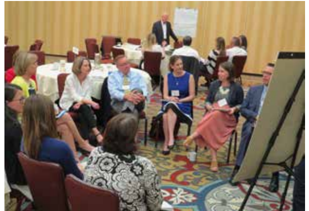
"Funding preK-12 Education" Community Town Hall, Tucson

After the statewide Town Hall, recommendations are communicated to a broader audience through traditional and social media, published reports, and Community Outreach Programs held around the state.