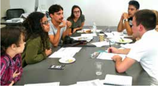
"Funding preK-12 Education" Future Leaders Town Hall, Arizona State University, Downtown Phoenix

Future Leaders Town Halls foster development of civic leadership skills for Arizona's next generation of leaders and allow them to have a voice on important policy issues.