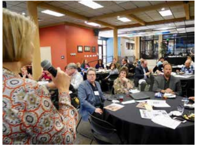
Above: "Criminal Justice in Arizona" Community Outreach Programs, Prescott Below: "Strong Families Thriving Children" Community Town Hall, Yuma

Individuals who participate in the Statewide Town Hall serve as presenters for Community Outreach Programs and share their thoughts on the recommendations.