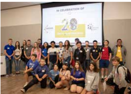
"Strong Families Thriving Children" Future Leaders Town Halls