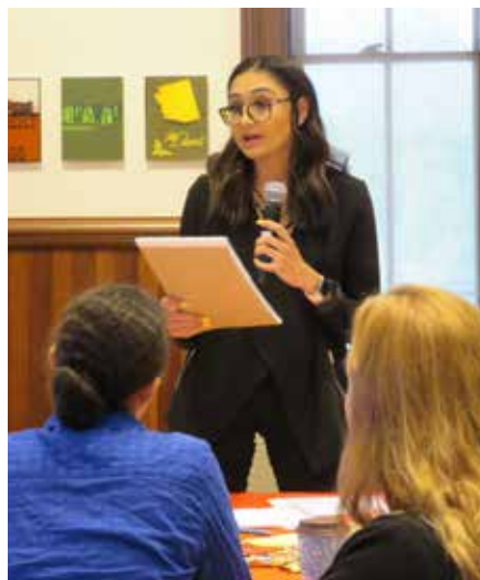
Above: Community Recreation Center, Casa Grande Right: University of Arizona, Tucson

Future Leaders Town Halls foster development of civic leadership skills for Arizona's next generation of leaders and allows them to have a voice on important policy issues. A summary of the discussions from each Future Leaders Town Hall event is carried forward for consideration at the Statewide Town Hall.