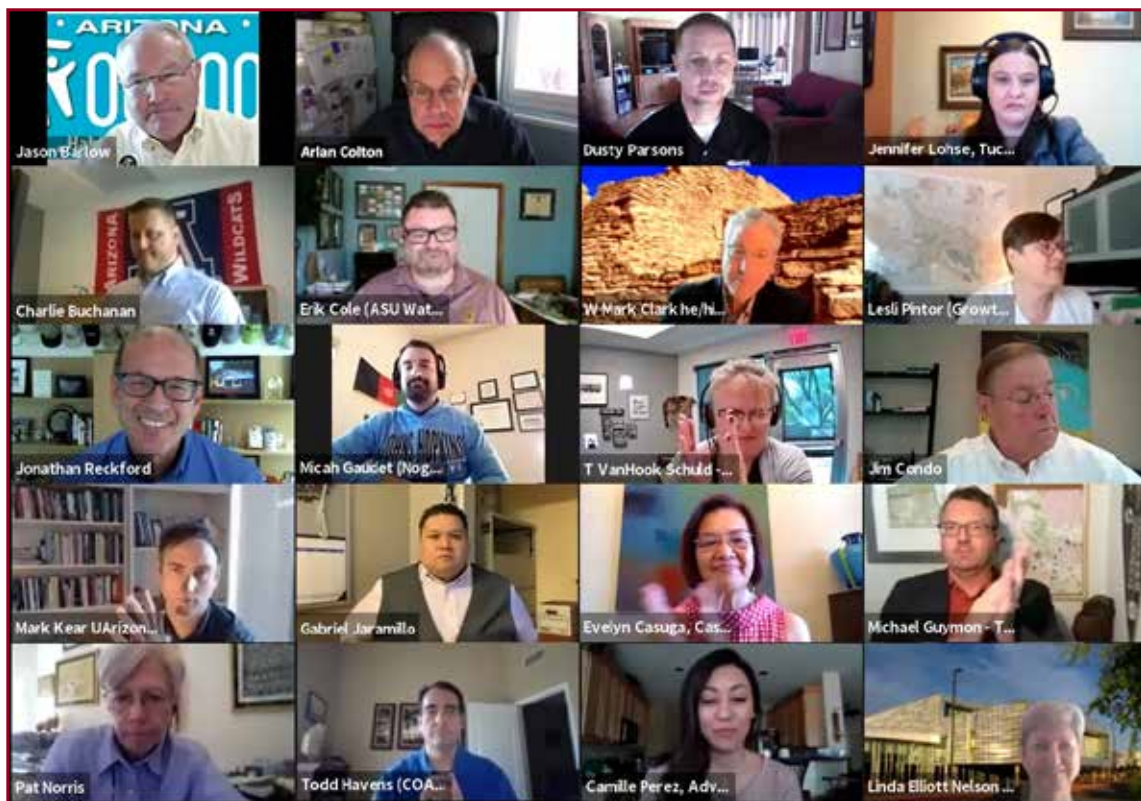
Participants of the Habitat for Humanity 2020 Equitable Development Forum consulting program

During 2020, Arizona Town Hall provided consulting services to entities interested in solution-based discussions, including: the Federal Reserve, Arts Midwest and Western Arts Alliance, the Arizona Hispanic Chamber of Commerce, Northern Arizona Council of Governments (NACOG), Habitat for Humanity of Arizona, and the Arizona Supreme Court.