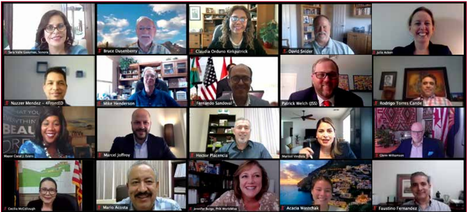
Participants of various 2020 virtual town hall programs