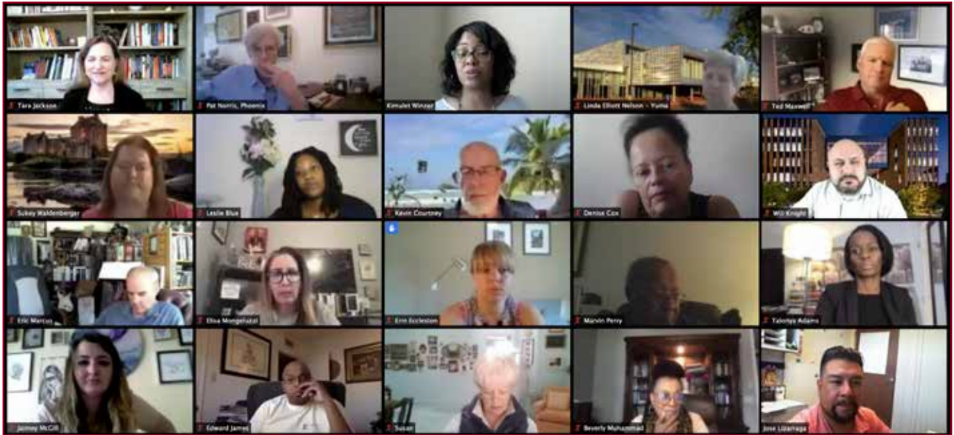
"Learning and Listening About Systemic Racism" Virtual Town Hall

As we responded to the needs of the moment, non-traditional platforms merged with Arizona Town Hall's well-known consensus model to create even greater opportunities for participation.